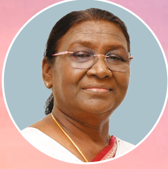
SMT. DROUPADI MURMU Hon'ble President of India