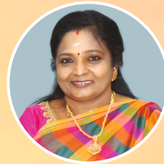
Dr. (Smt.) TAMILISAI SOUNDARARAJAN Governor of Telangana & Lt. Governor of Puducherry